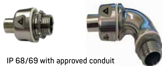
IP 68/69 with approved conduit